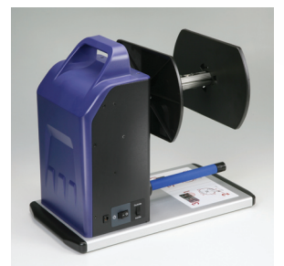
Stylish appearance plus a rugged design for long term reliability