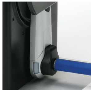
Colored LED indicator provides rewriter operation status