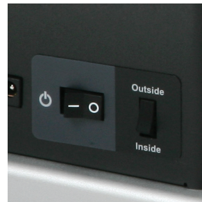
Rewinding direction switch to rewind "inside or outside" label rolls